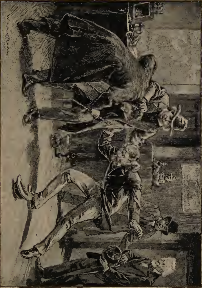
"THEY 'PUT THEIR HEADS TOGETHER' IN A NEW AND PAINFUL WAY"